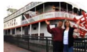
New Orleans - Join Us