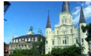
On to New Orleans 2012