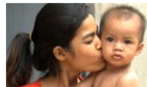
The Eliminate Project